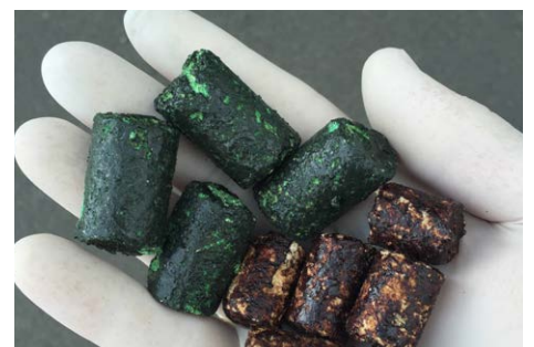
Top: 1080 bait. Bottom: Baits covered in deer repellent. The non-toxic pre-feed pellets are brownish-tan while the toxic baits are green.