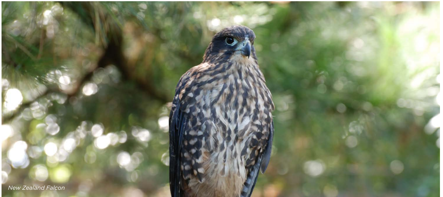
New Zealand Falcon

been extremely successful at knocking possum numbers down to very low levels in the past. It is preferred in areas like Timaru Creek due to the rugged nature of the terrain. The Parliamentary Commissioner for the Environment also supports aerial control. The commissioner completed an extensive review into the use of 1080, in which she strongly endorsed its continued use in New Zealand.