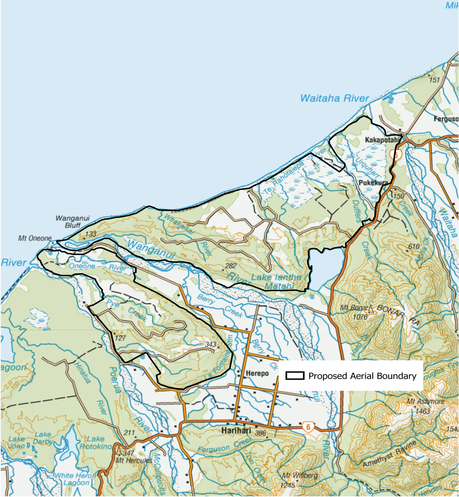
Topographic data sourced from the LINZ Data Service and licensed for reuse under the CC BY 4.0 licence.

The operation will have additional conservation benefits for native birds and bush. Possums eat the forest canopy and prey on native birdlife, including eggs and chicks. Biodegradable 1080 is also extremely effective at controlling other introduced predators such as ship rats and stoats.