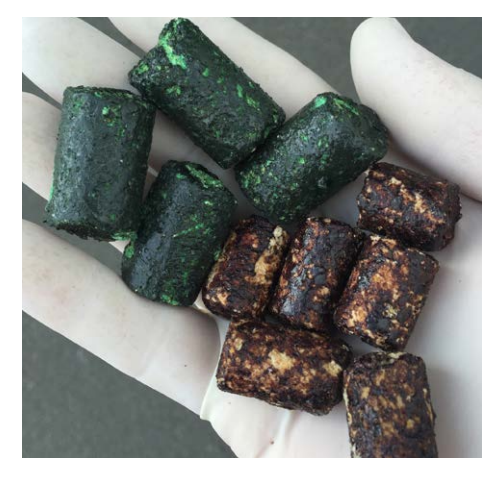
Green possum control 1080-pellets coated with EDR look significantly different to the brown pre-feed baits, right.

were used to compare the number of deer seen a month before the 1080 aerial operation (June) and a month after (July). Two other trail-camera grids were set up in a nearby unbaited block of very similar habitat and deer density to enable a comparative trial.