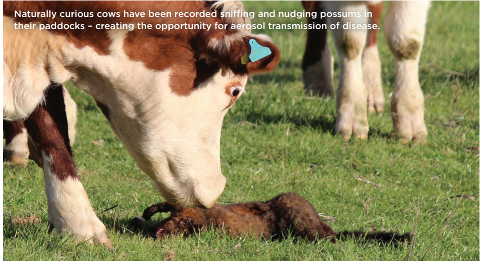
Naturally curious cows have been recorded sniffing and nudging possums in their paddocks – creating the opportunity for aerosol transmission of disease.

In New Zealand, cattle and deer are the species most at risk of contracting bovine TB. The TBfree programme is designed to eradicate the disease by using a combination of disease surveillance (TB testing and inspection at slaughter premises), controlling stock movement, and